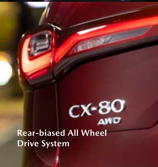
Rear-biased All Wheel Drive System