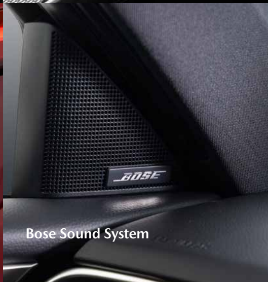
Bose Sound System