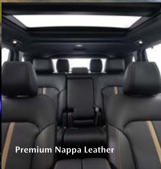
Premium Nappa Leather