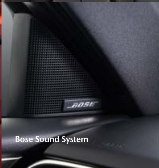
Bose Sound System