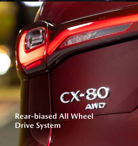
Rear-biased All Wheel Drive System