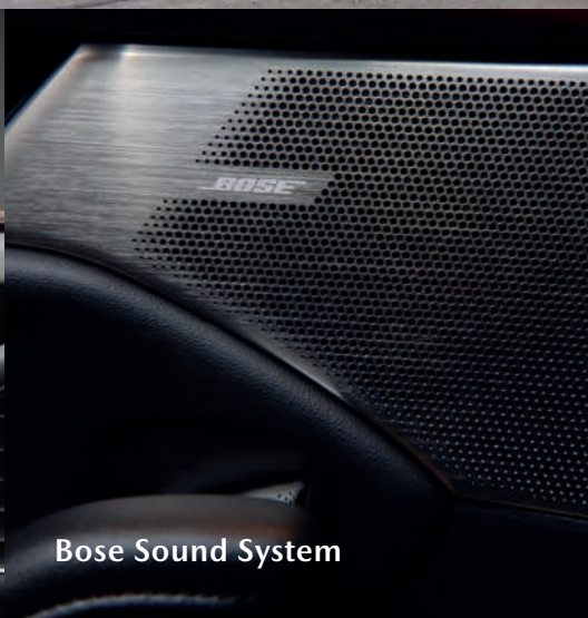
Bose Sound System