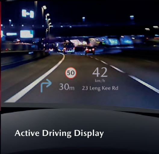
Active Driving Display