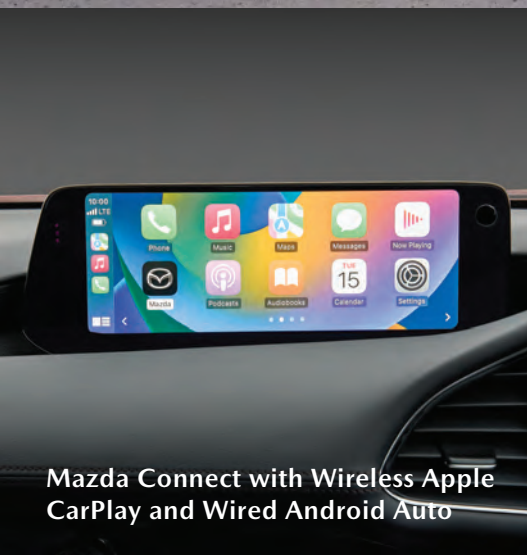
Mazda Connect with Wireless Apple CarPlay and Wired Android Auto

Visual is for illustration purposes, may vary according to variant.