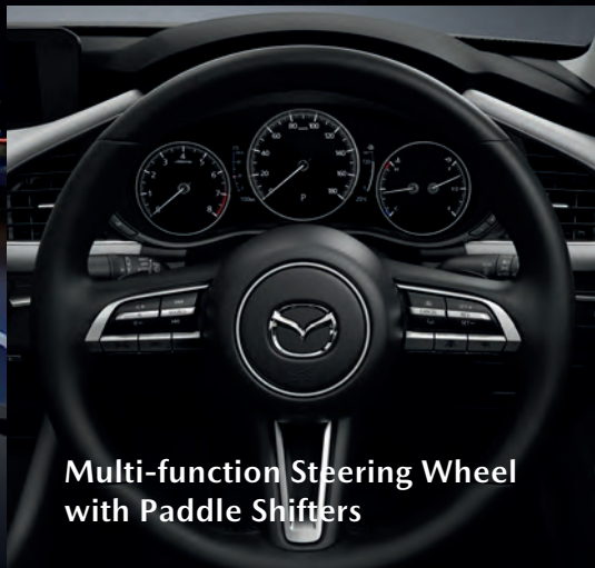
Multi-function Steering Wheel with Paddle Shifters