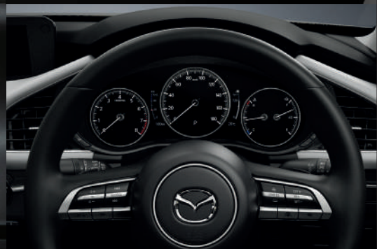
Multi-function Steering Wheel