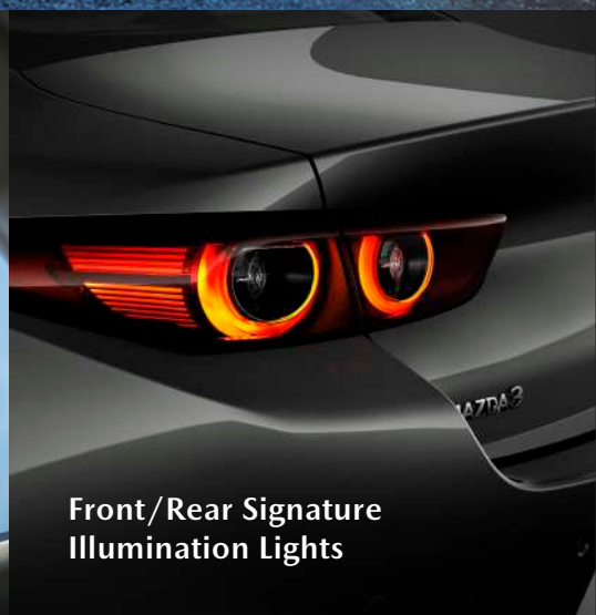
Front/Rear Signature Illumination Lights