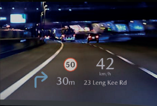
Active Driving Display