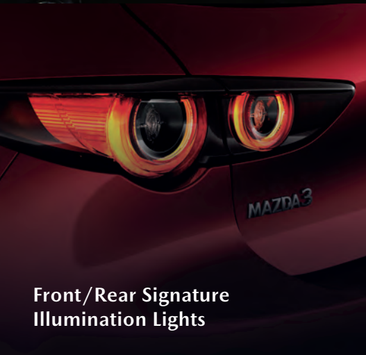
Front/Rear Signature Illumination Lights